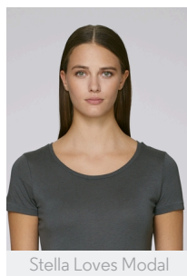
Stella Loves Modal