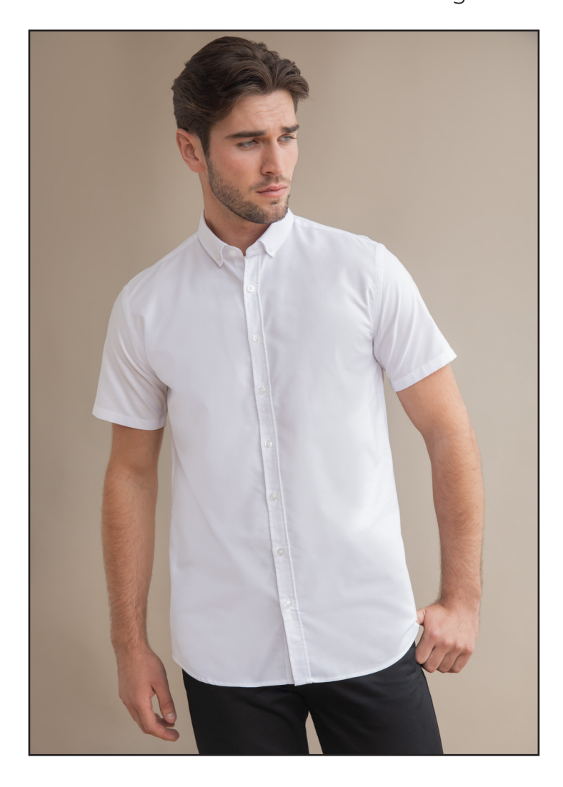
H517R Modern Oxford Short Sleeved Shirt - Regular Fit